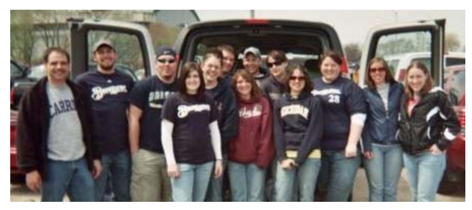
Butane: The Carroll College Chemistry Club Waukesha WI

Butane frequently visits elementary schools and the local children's museum to demonstrate of the wonders of chemistry to children and adults alike. They also educate and entertain middle school children who visit their campus each year. The members of Butane maintain a chemistry club website where they point to outstanding online science resources and answer science questions submitted by students, teachers, and parents.